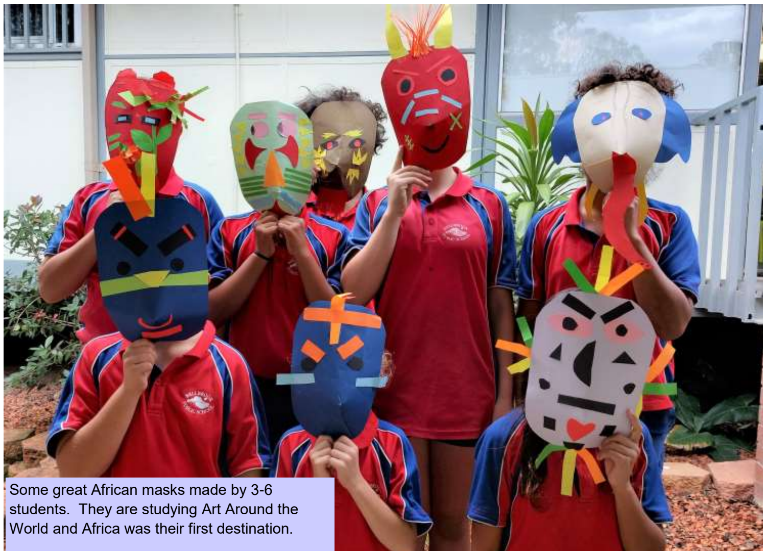
Some great African masks made by 3-6 students. They are studying Art Around the World and Africa was their first destination.